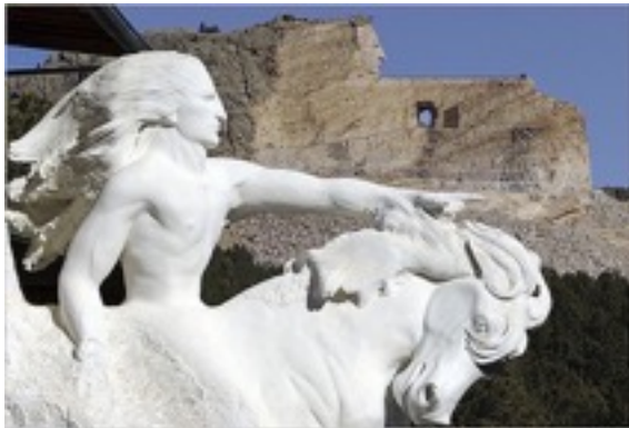
Statue of Crazy Horse with Crazy Horse Memorial in background, Black Hills, South Dakota

An outstanding biography of the life of Crazy Horse, written by the famous American writer Larry McMurtry, documents this with great clarity. Part of the Penguin Lives Biographies series, the book is called Crazy Horse: A Life . It seeks to separate the real life of Crazy Horse from such false and manufactured legends in movies like “They Died With Their Boots On” (1941) with Errol Flynn depicting General George A. Custer.