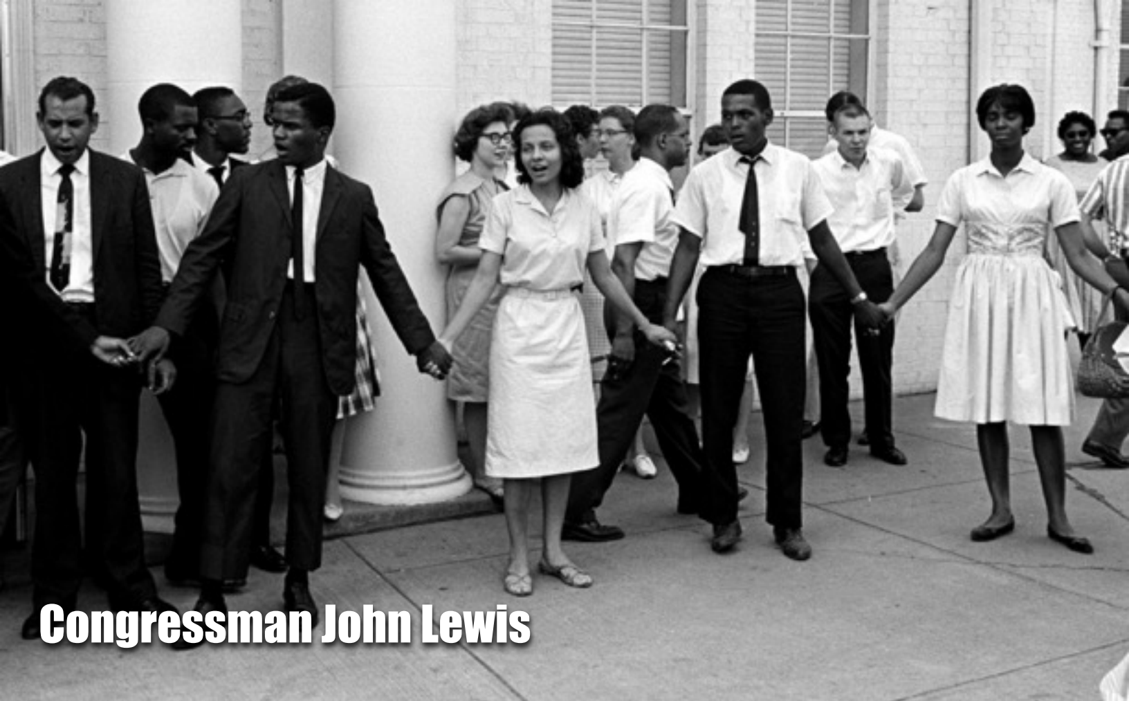
Congressman John Lewis